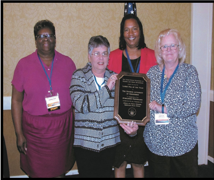
Large Housing Authority of the Year: Congratulations Henderson Housing Authority